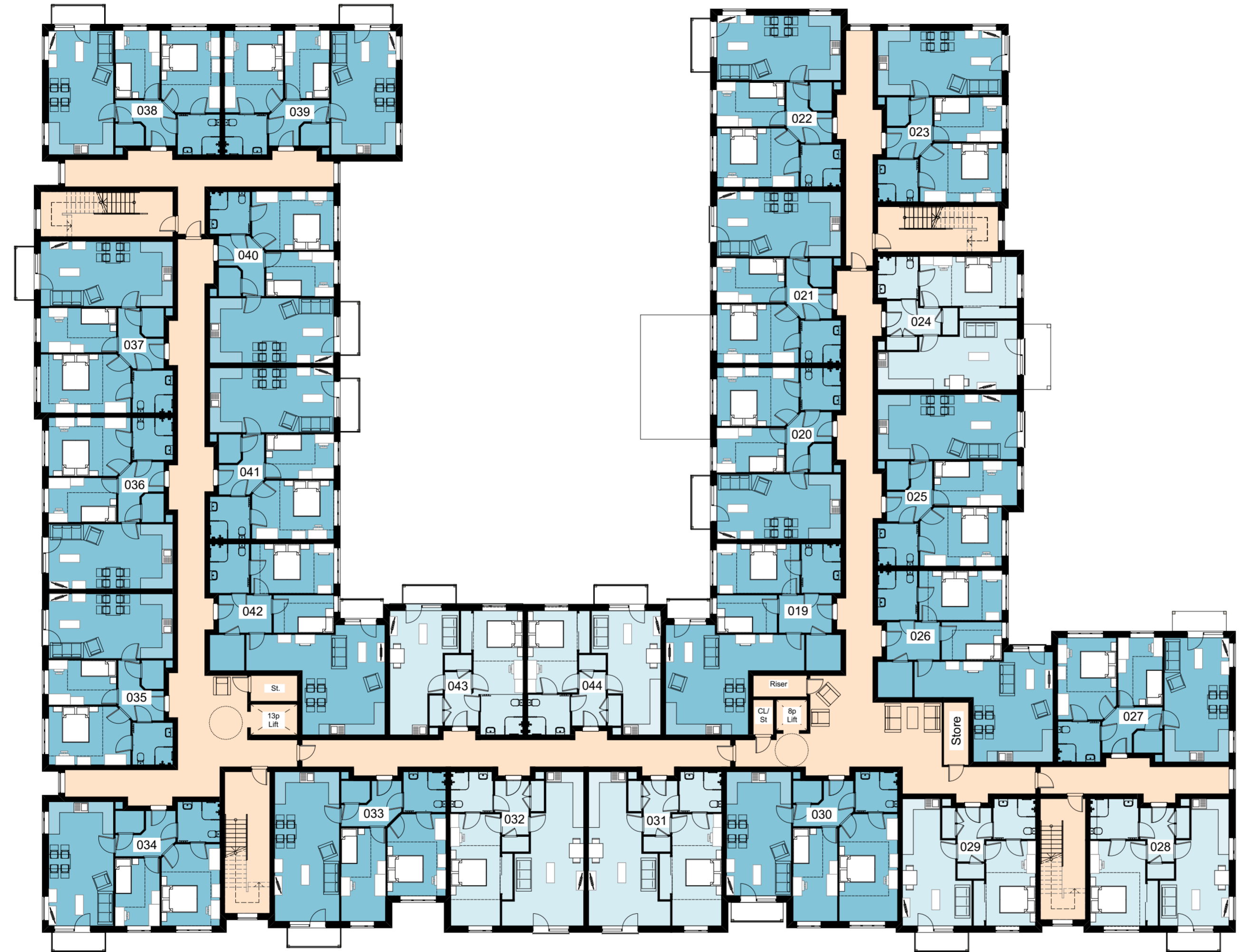
Proposed First Floor plan